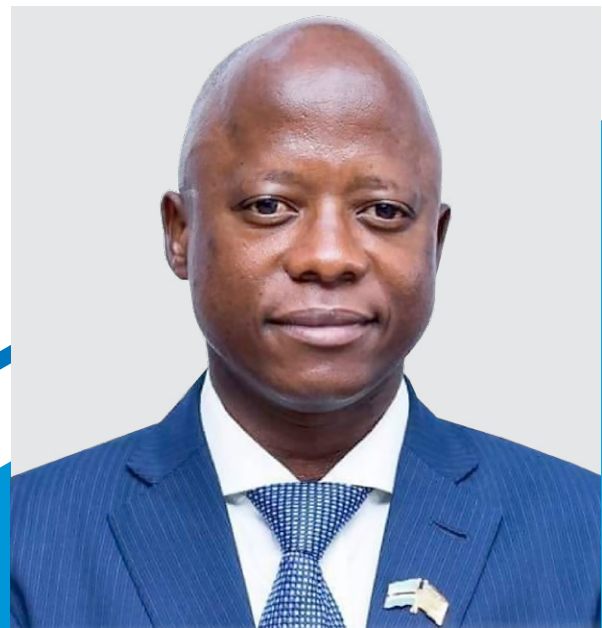
Honourable Mmusi Kgafela Minister of Investment, Trade and Industry of Botswana

Your Excellency, you may now take the podium and deliver your Keynote Address. I thank you all for your attention.