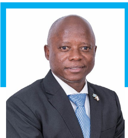
Hon. Mmusi Kgafela Minister of Investment, Trade and Industry, Republic of Botswana

“The Roundtable provides an opportunity to identify cross-border value-chains that can be developed so that all SACU Members can benefit from the opening of markets to our north. It is also a showcase to investors of the attraction of Southern Africa as we advance manufacturing and innovation hubs of our continent”, Hon. Ebrahim Patel