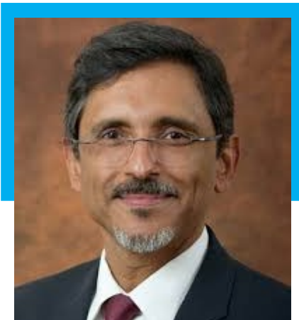
Hon. Ebrahim Patel Minister of Trade, Industry and Competition, Republic of South Africa

“I support that this platform deliberations should continue to indicate, from an industrial policy perspective, how we all could harness the SACU rebates and duty drawbacks to develop these identified value chains further. A key common theme around these investment and business opportunities is the cost structure that points to high tariffs on energy and in certain sectors other inputs such as - for example the cost of the feed in poultry an input tends to be a major cost component in certain value chains. A common approach to reduce these high input costs must also be investigated from a SACU regional industrial policy perspective”, Hon. Lucia lipumbu.