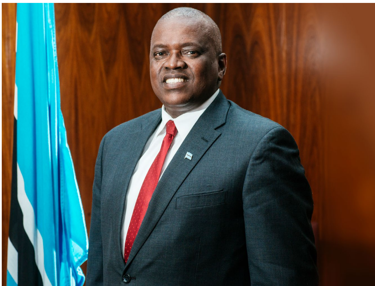
His Excellency Dr. Mokgweetsi E.K. Masisi President of the Republic of Botswana and Chairperson of the SACU Summit