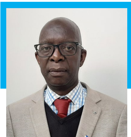
Hon. Dr. Thabiso Paul Molapo Minister of Trade and Industry, Kingdom of Lesotho

“We align ourselves with the view that the implementation of our cross-border projects will not be possible without a suitable, inclusive and participatory funding model. We believe such a model has been identified under the Work Programme, to enable SACU to achieve our industrialization aspirations and ambitions”, Hon. Senator Manqoba Khumalo.