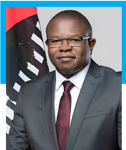
Hon. Senator Manqoba Khumalo Minister of Commerce Industry and Trade, Kingdom of Eswatini